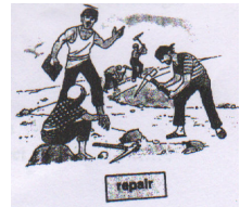
( repair )

45. What is the woman telling the girl to do ?