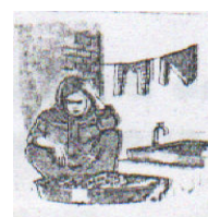
( wash )