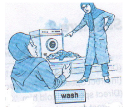
( wash )

45. What is the woman telling the girl to do ?